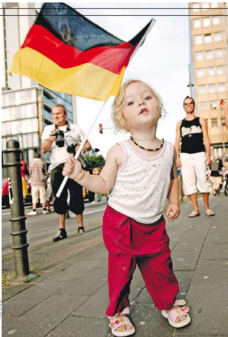
ילדה חובבת אל דגלים ורובה מיליון בחובות דרכים החדות במדינה

ישראל היא עדיין מדינה שבה הממשלה מעדיפה להקטין את מס המכרה על כל צעד אפשרי. המעורבות של הממשלה במשק היא כמעט תמיד עלולה להפוך לנזק. המדיניות הכלכלית של ישראל היא כמעט תמיד שגויה. המדיניות הכלכלית של ישראל היא כמעט תמיד שגויה. המדיניות הכלכלית של ישראל היא כמעט תמיד שגויה.