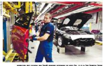
פועל במפעל בגרמניה, בו נמכר 4 מיליון כלי רכב מדי שנה.

גרמניה היא אחת מן המדינות המפותחות בעולם, ויש לה אחת הכלכלות הגדולות בעולם. ב-2013, גרמניה הייתה המדינה השנייה בגודלה בעולם מבחינת תוצרת הפנים (GDP) עם 3.5 טריליון דולר (2.8 טריליון יורו). גרמניה היא המדינה השנייה בעולם מבחינת צריכת האנרגיה (1.5 טריליון קילוואט שעה) והיא המדינה השנייה בעולם מבחינת צריכת המים (1.5 טריליון קובצ'ט).