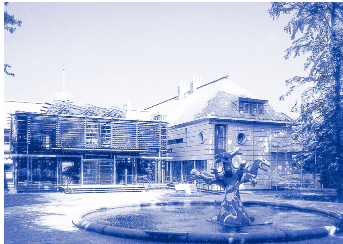
Conference Center of the Deutsche Post AG, Buch on Lake Ammersee

On the Policital Economy of Declining Industries